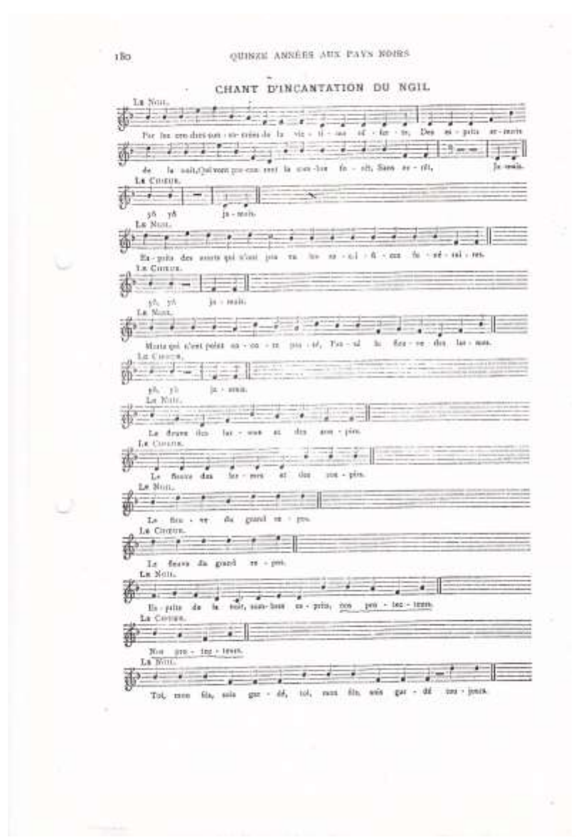
Note .-- The ngil or black - magician always carries with him a skull in which the ashes (with the rest) of some human sacrifice have been collected. The spirits of the dead who found no eternal rest but wander - at night in the jungle - are the guardian spirits of the ngil.-- He calls them by the melody and the lyrics.

180 quinze années aux pays noirs calling listen of the ngil, chant d' Incantation du ngil